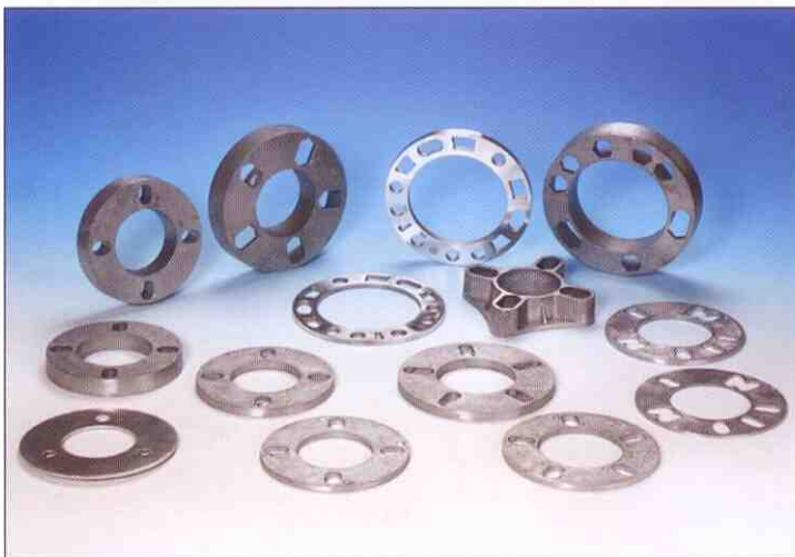
▲ WHEEL SPACERS From 3mm to 32mm Thick 3-4-5 Stud patterns

GRAYSTON are one of the largest suppliers of nuts/bolts/studs-studding/spacer kits and spacer shims in the automotive aftermarket. GRAYSTON supply into every type of customer in the automotive industry including original equipment and most major alloy wheel manufacturers.