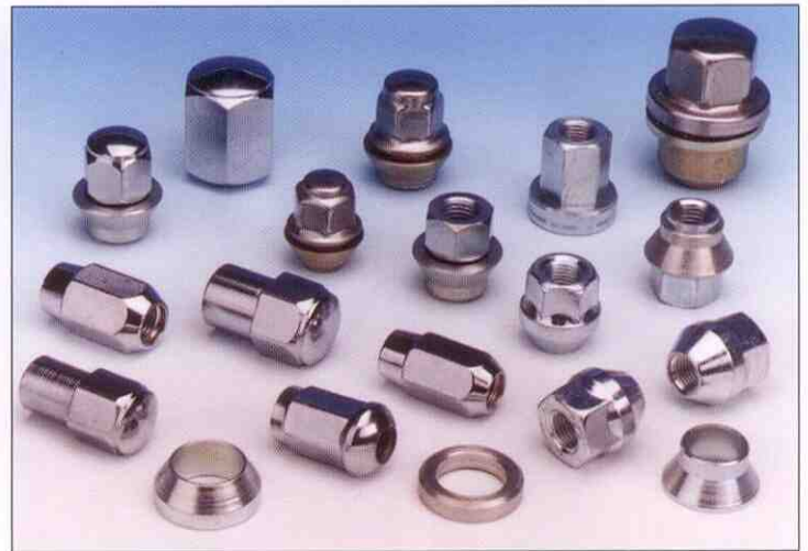
▲ WHEEL NUTS O/E and after market fitments.